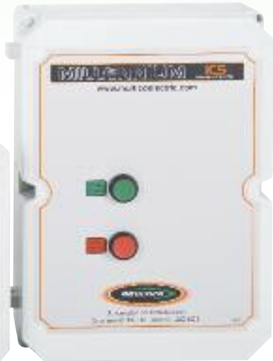
UL VERSION (NEMA 4X)

Multico offers a wide range of starter for any application