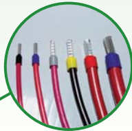
Systematic use of ferrules on wire ends